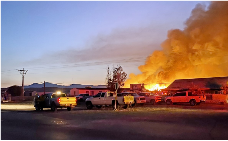
June 18, 2020: The Mims fire as seen from Casa Rio Village mobile home park